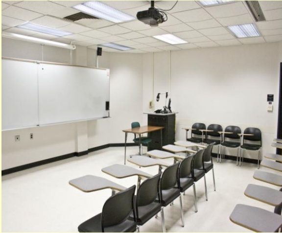
468 PH (new chair rail)