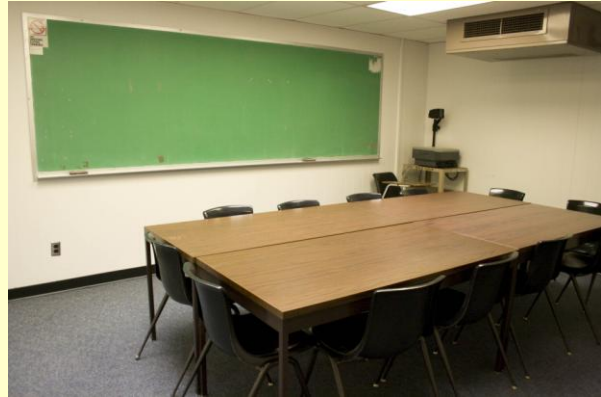
W18 SSH (new carpet)